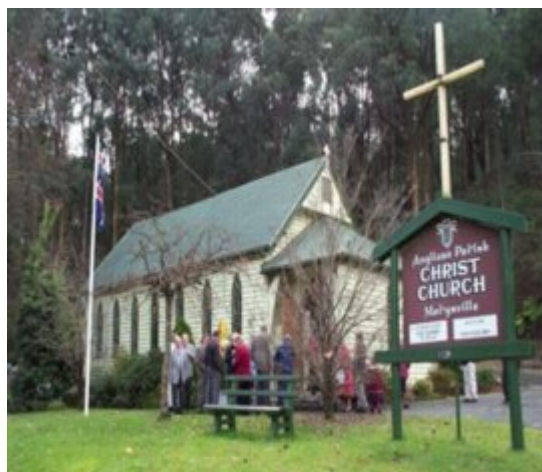
Christ Church, Parish Church, Marysville before being burnt and totally destroyed